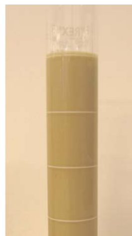
Tahina with 1% of Palsgaard® OilBinder 01